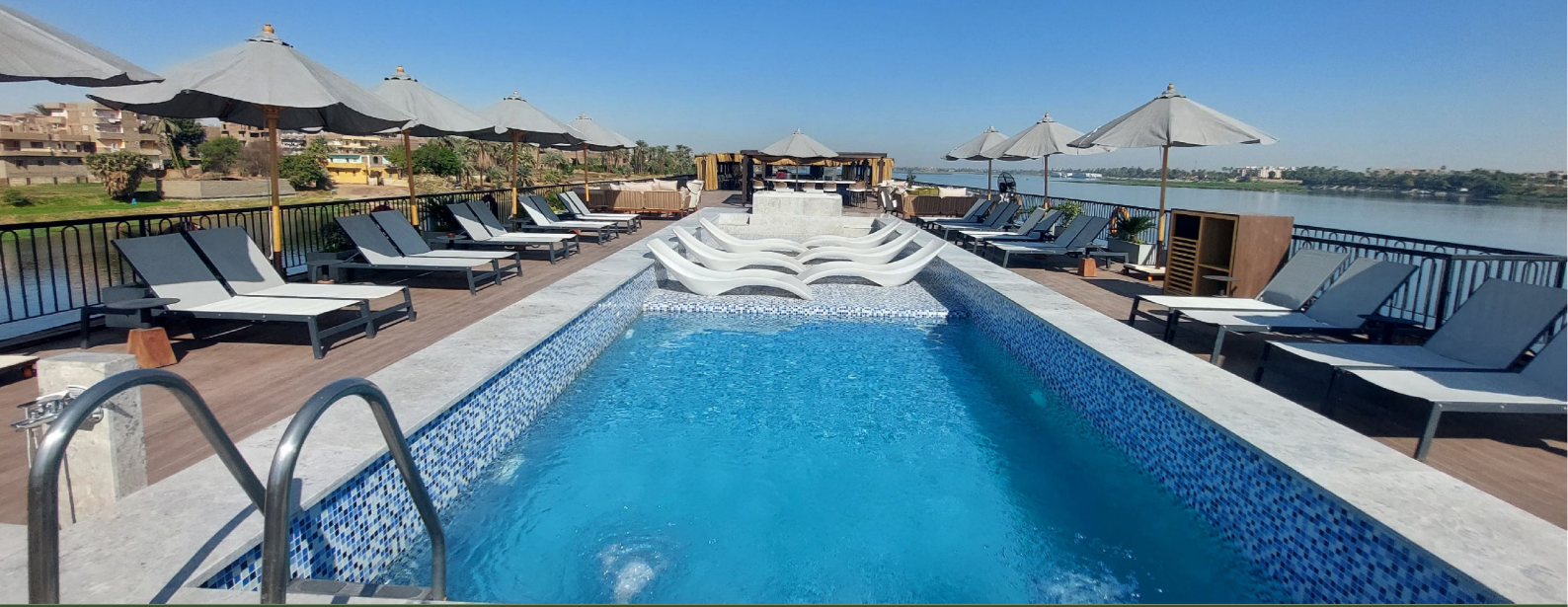
Sun deck and pool